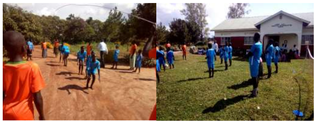
The Centre's children and young people wearing new sports kit